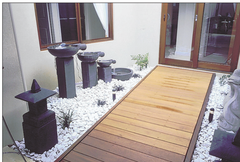
The owners brought construction materials and decorative items from Bali.