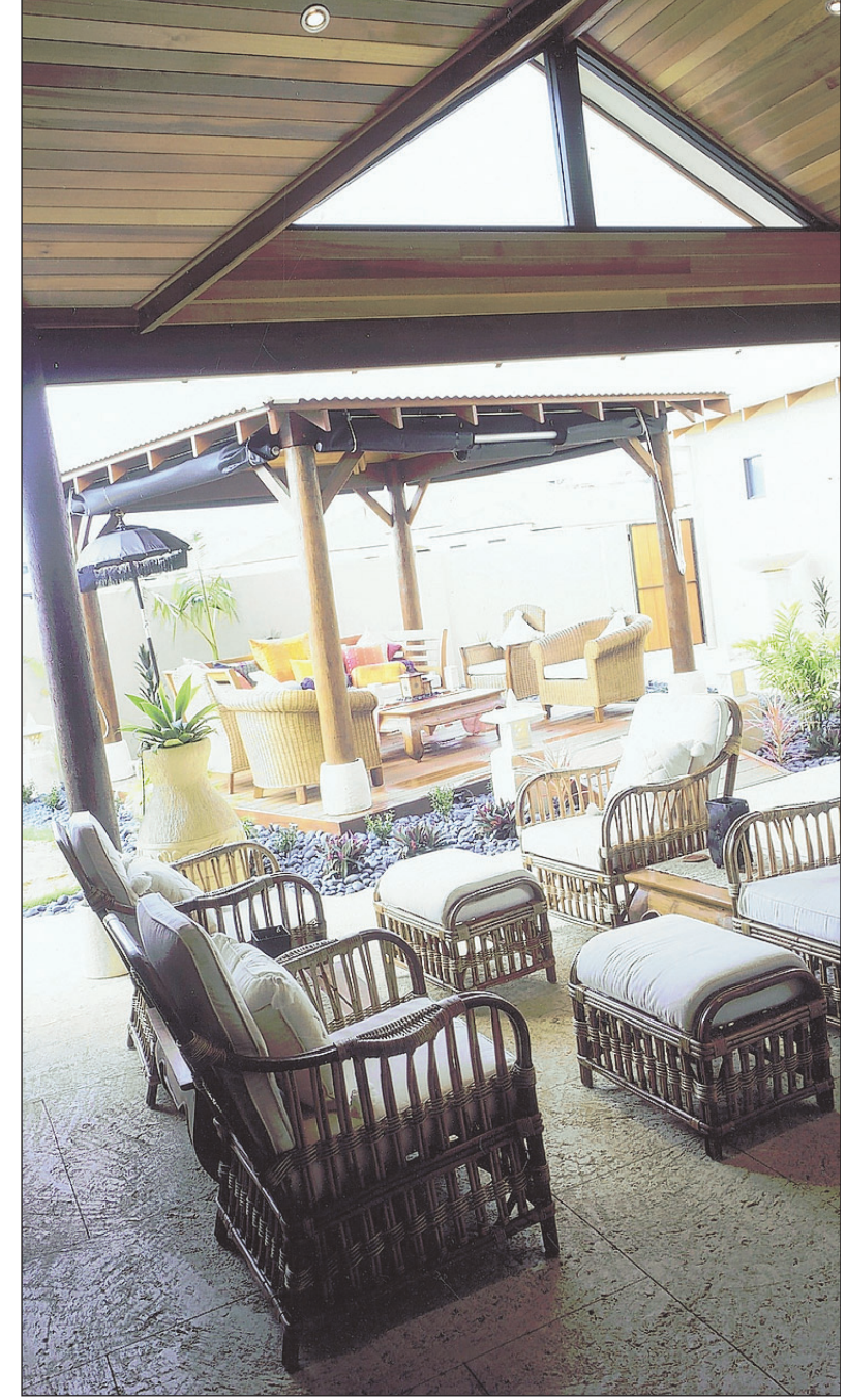
Living areas are arranged around an atrium with views of a backyard pavilion.

The passage continues past a bathroom and powder room to the