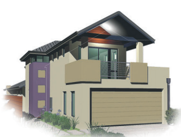
House RA#80 - Narrow Lot Infill - Upstairs Living