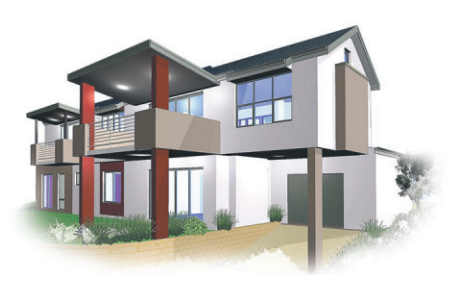
House RA#60 - Conventional Lot